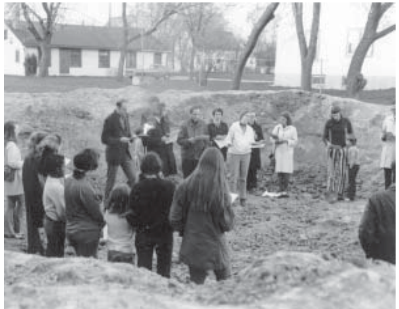
In the spring of 1972 over 100 Ann Arborites dug a bomb crater 40 feet across and 6-8 feet deep in a vacant lot on Jewett Street to demonstrate the destruction caused by one 500-pound "daisy cutter" bomb in Southeast Asia.

This campaign will strengthen our ability to organize for peace and justice well into the future. To learn more, contact Chuck at 734-663-1870 or chuck@icpj.net .