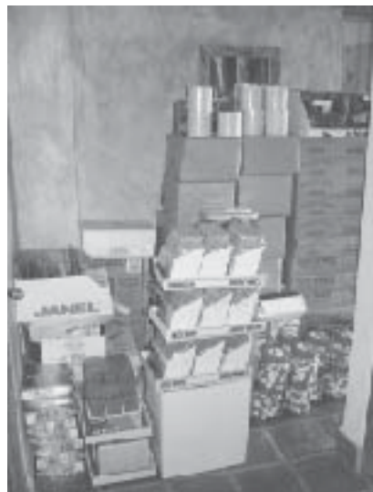
School supplies for a Zapatista autonomous school.